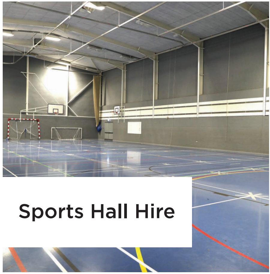
Sports Hall Hire