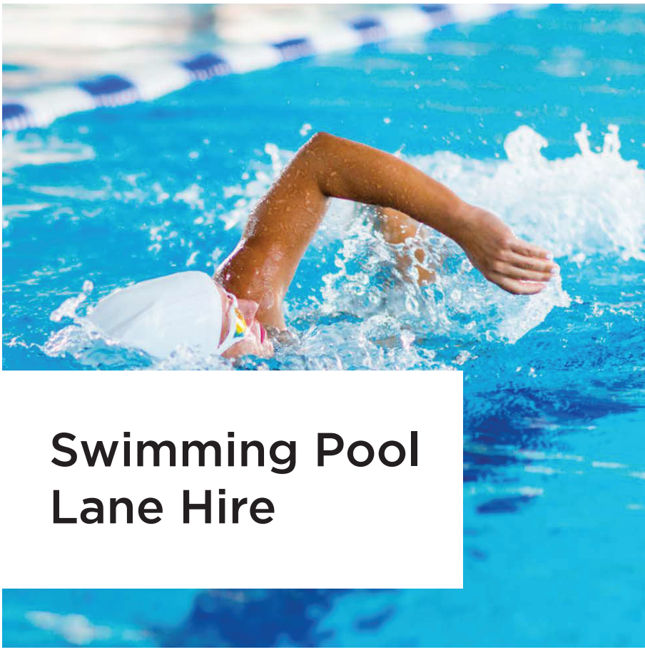
Swimming Pool Lane Hire